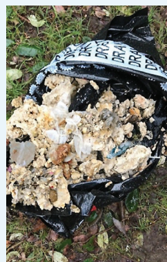
Parts of the fatberg that was blocking the pipe.

As well as investigating with CCTV camera inspections and flushing out around 4 tonnes of solids from the wastewater pipeline, our staff talked to local businesses in the area about how to correctly dispose of fats, oils and grease.